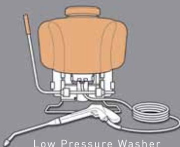
Low Pressure Washer